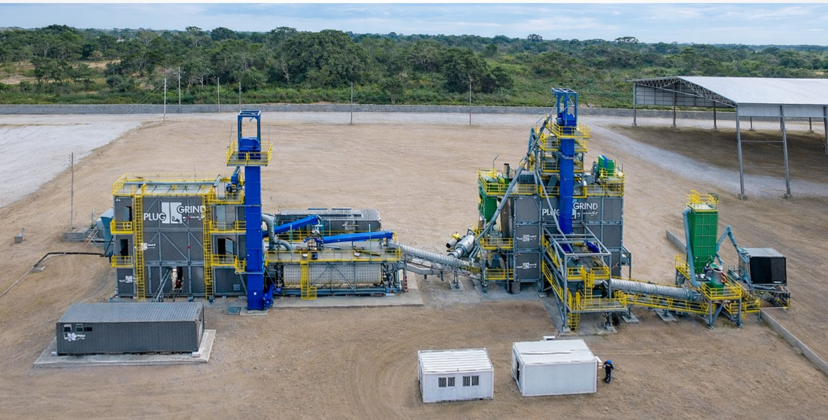
Río Blanquito Plant, San Pedro Sula, Honduras - 2025

For this architecture, rolling-element bearings were selected on the trunnions instead of conventional journal bearings — a forward-looking decision aligned with the requirements of modular mills: lower friction, high radial load capacity with displacement capability, simplified lubrication, and a reduced support footprint.