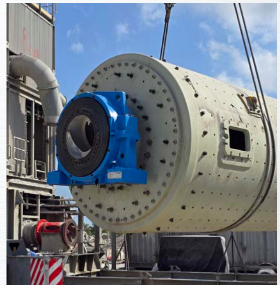
↑ Installation of the Plug&Grind® XL at the plant, with our tailored engineering solution fully integrated to ensure reliability and performance. ↑