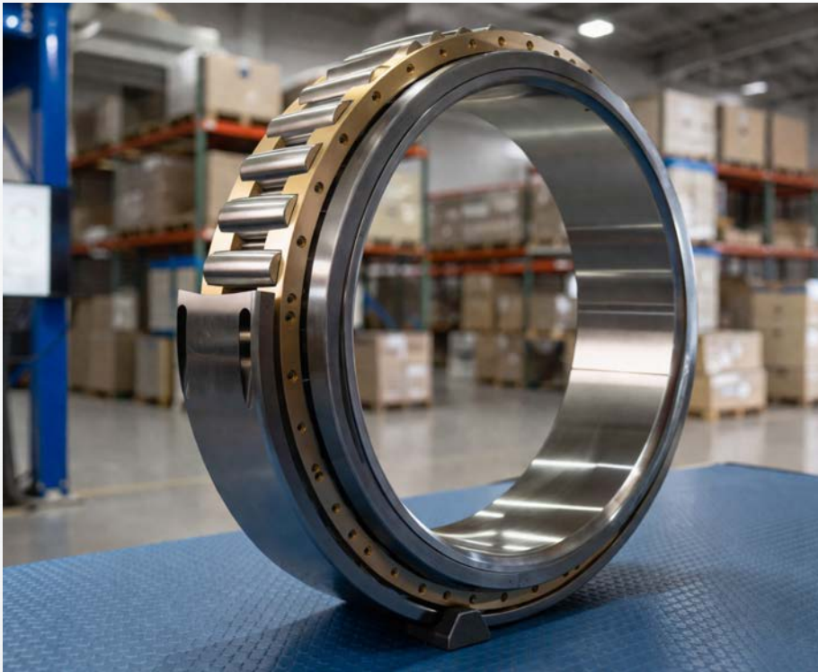
↑ The largest Split Toroidal Roller Bearing (STRB) ever manufactured, featuring a 950 mm bore diameter.