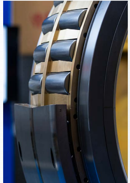
↑ Detail SRB