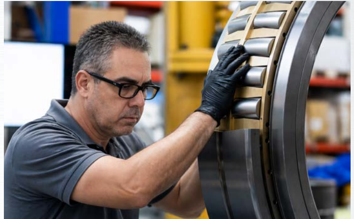
↑ Assembly, quality control and measurement of STRB and the SRB at our Miami operations facility. ↑