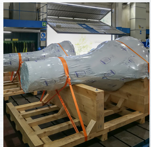
Main Shafts packed and ready to be shipped

The biggest challenge in this project was the tight delivery with keeping competitive pricing. ABS mobilized all its engineering resources and supply chain to cope with the demanding delivery dates. Since our product was just one piece out of a puzzle, the timing of our deliveries was key.